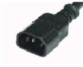
IEC320 C14 10A plug